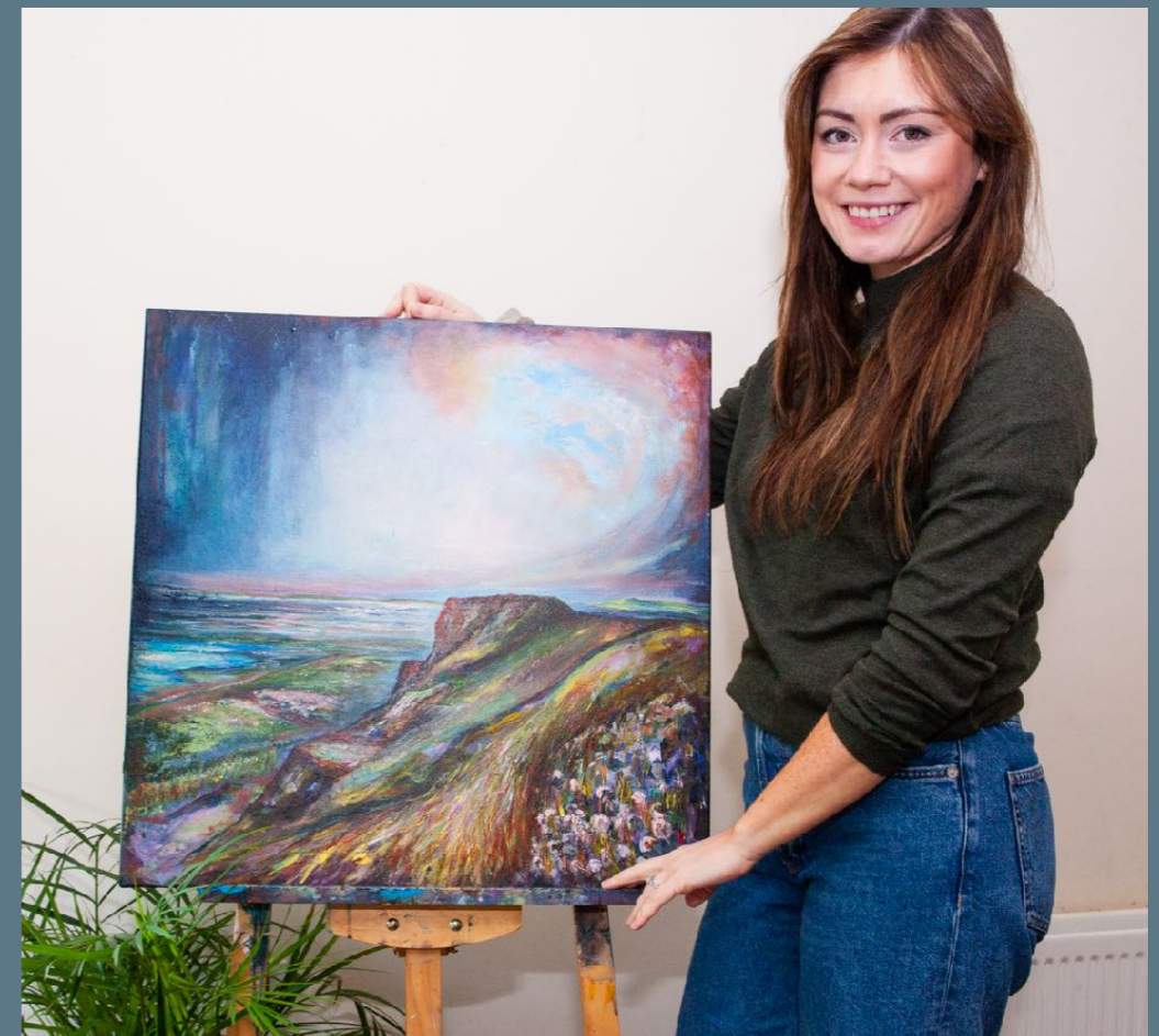
60x60cm unframed canvas