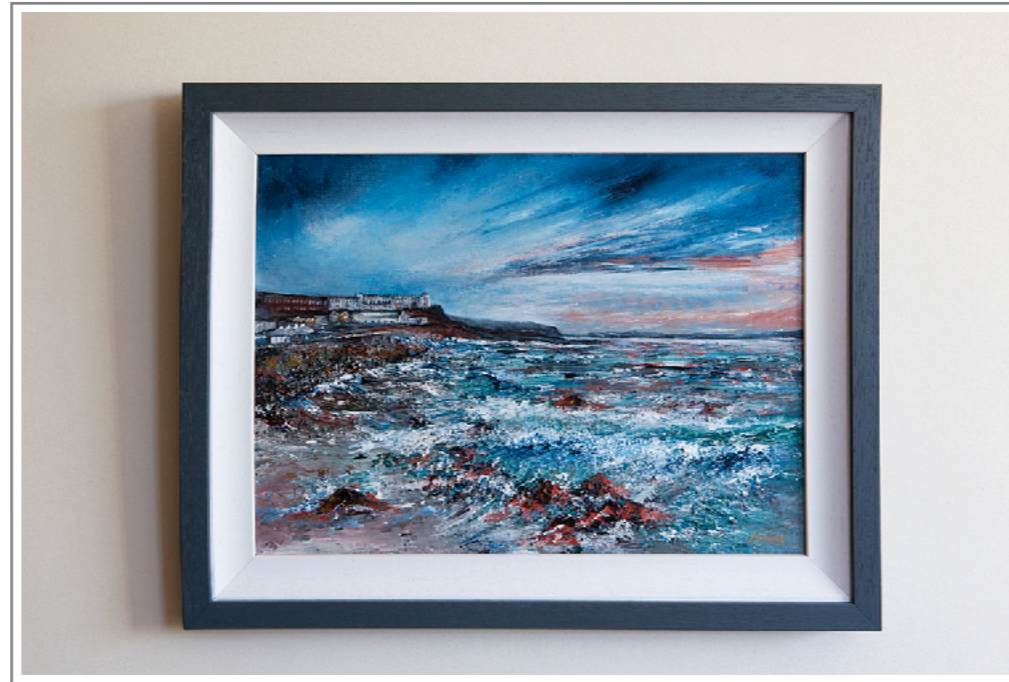
30x40cm bespoke framed canvas