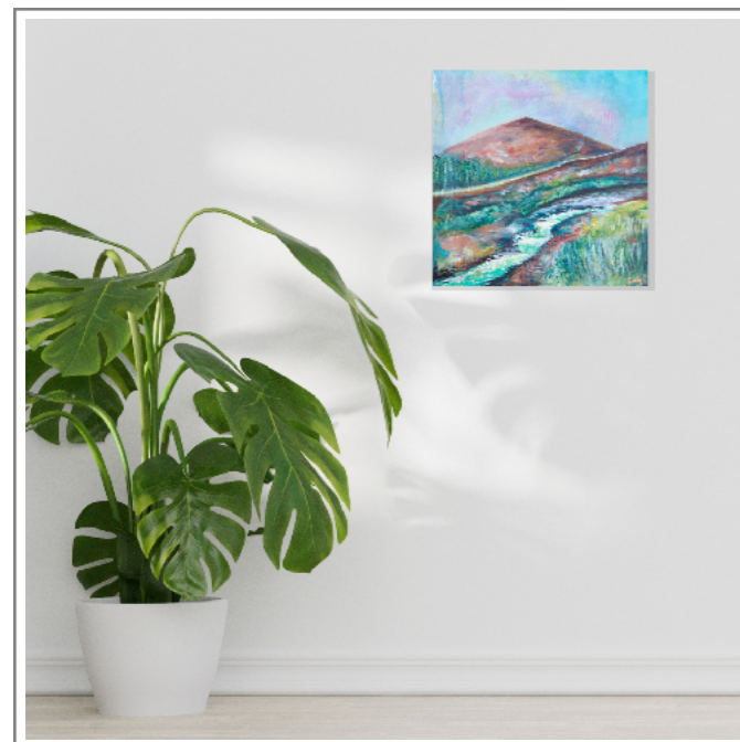
30x30cm unframed canvas