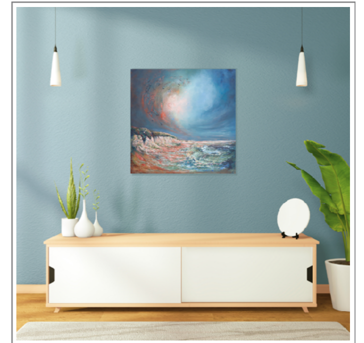
60x60cm unframed canvas