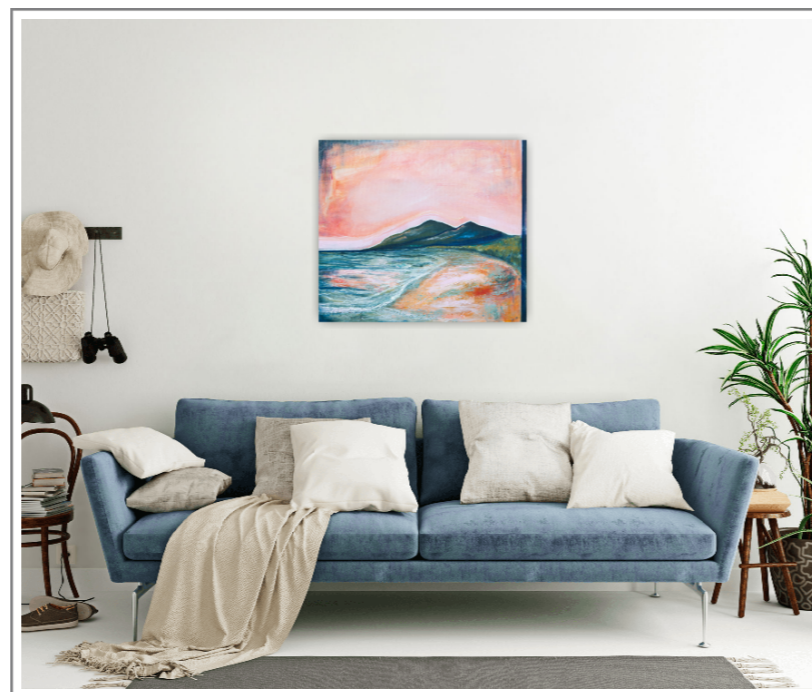
50x70cm unframed canvas