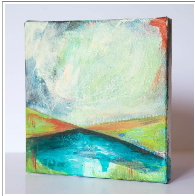
20x20cm framed canvas