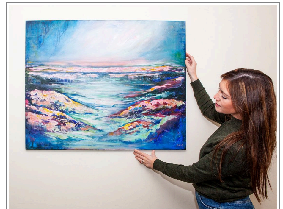
70x100cm unframed canvas